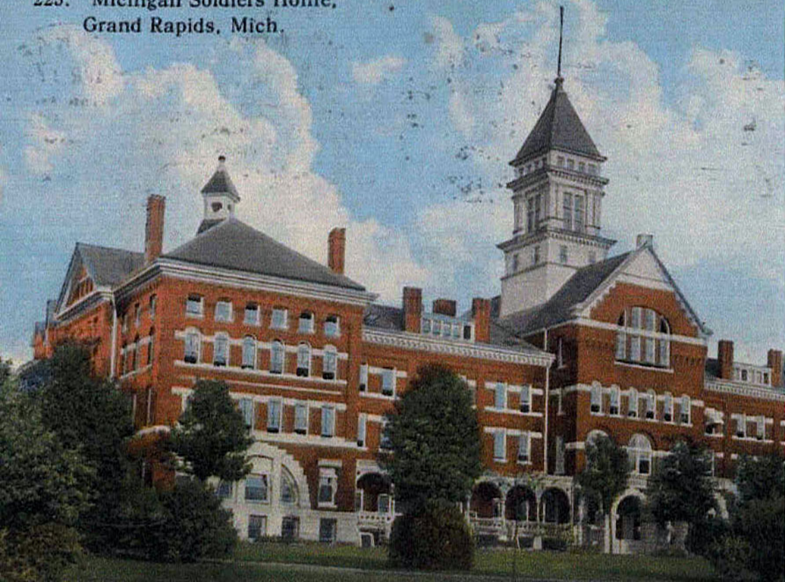
225. Michigan Soldiers Home, Grand Rapids, Mich.